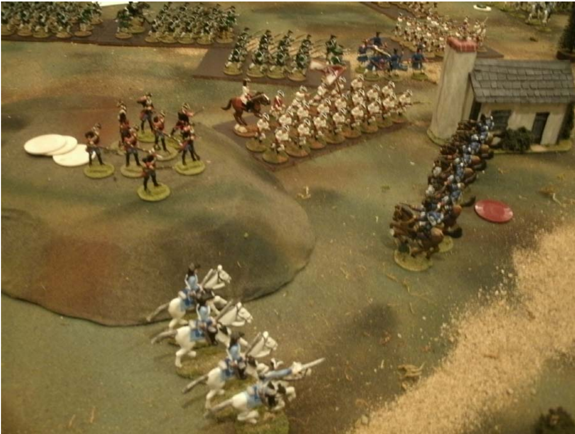
The Usual HAWKS 40mm Half Rounds In Action