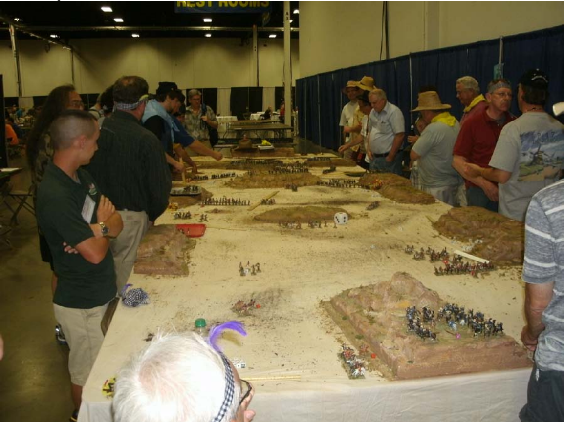
Scenarios Like This Battle of the Rosebud Won Him This Year's "Uncle Duke" Award