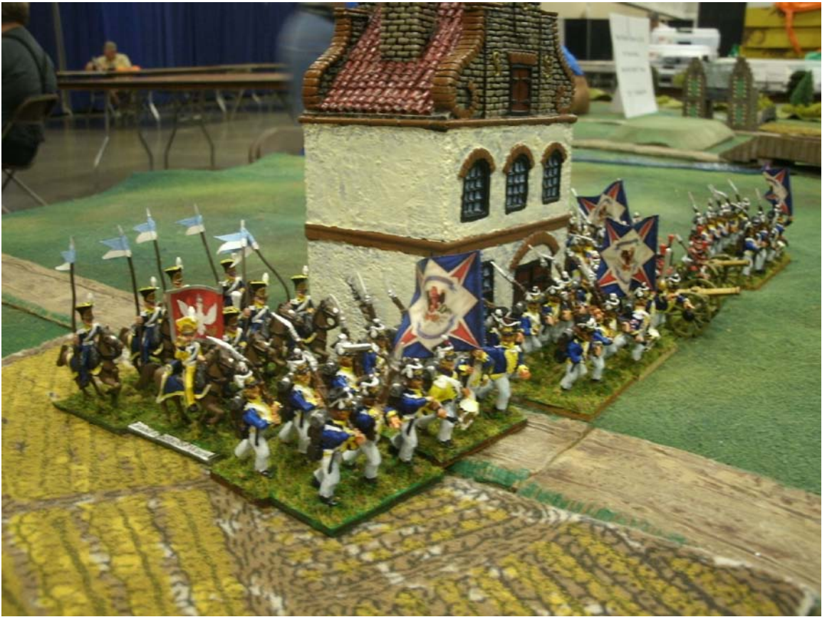
Napoleon's Grand Duchy of Warsaw Troops-Good Figures, Great Painting