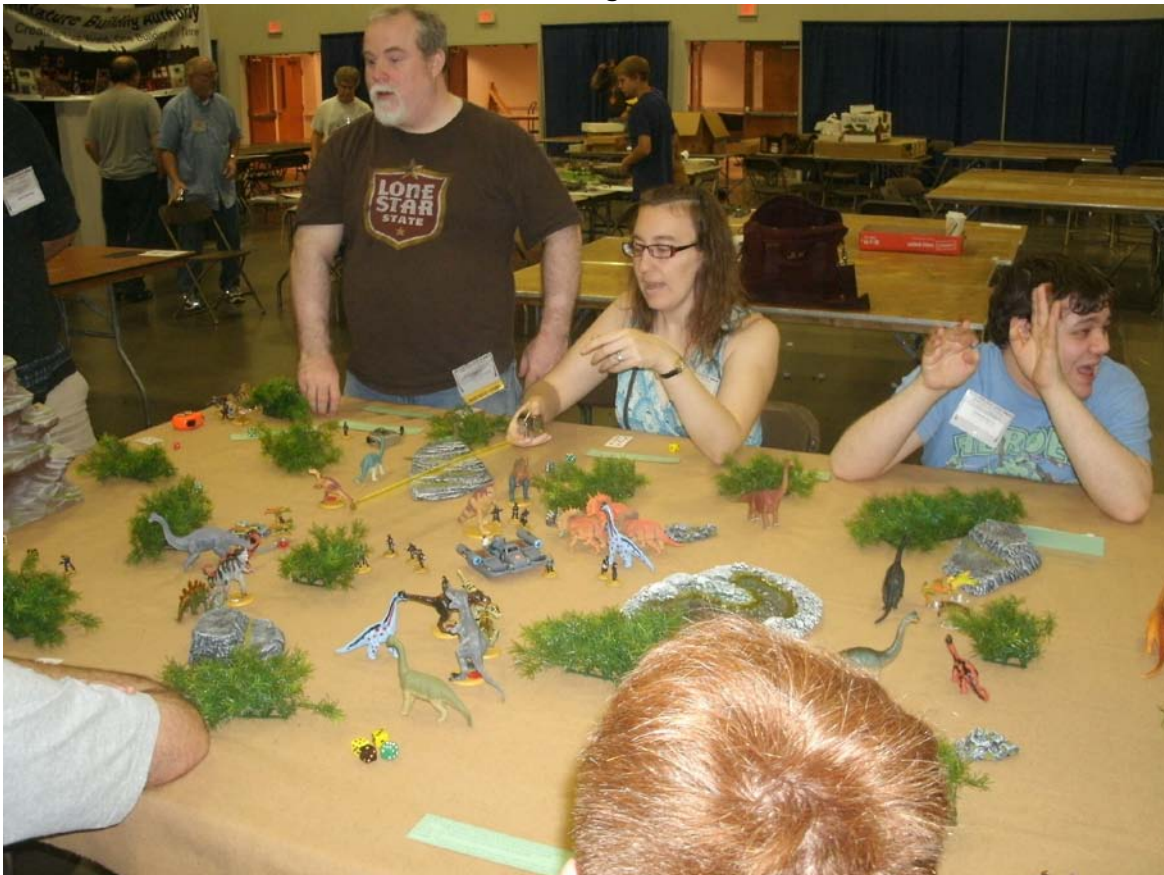
The Monday Night Adventurers Brought Back "EAT HITLER"