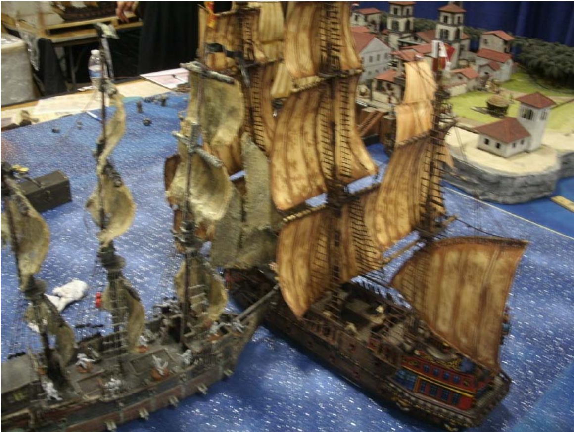
In Various Scales And Periods