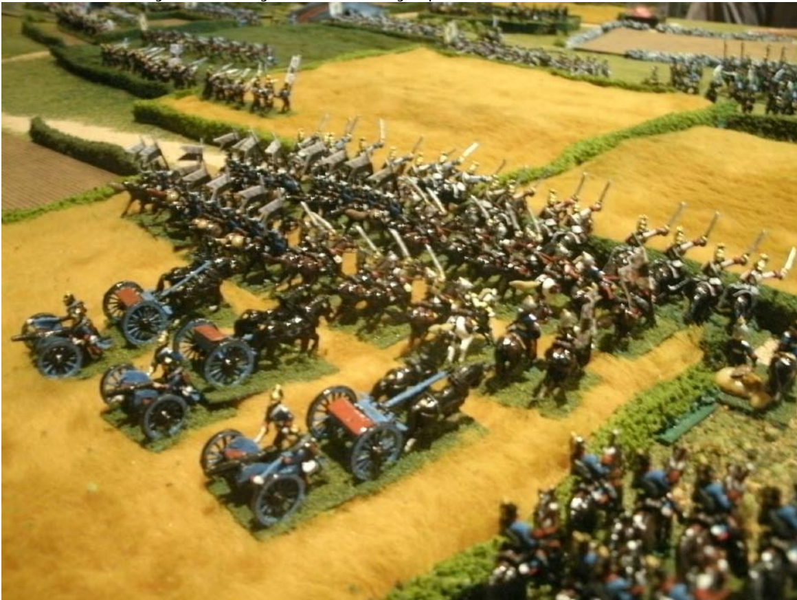
To The Austro Prussian War And Beyond