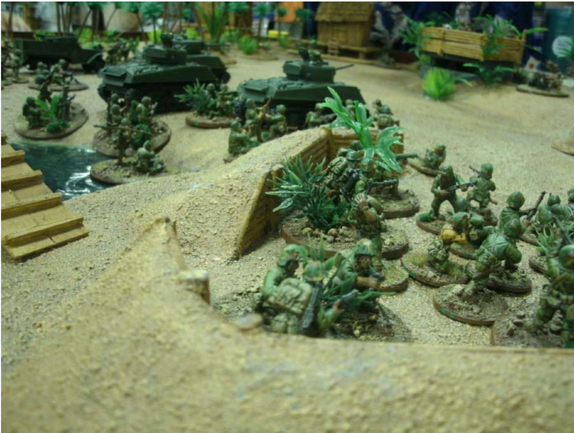
Dealer Games Including This Pacific Battle