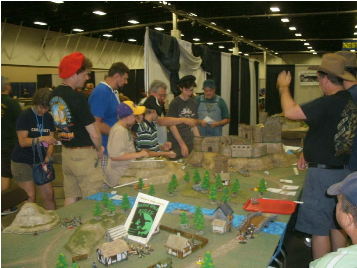
Miniature Building Authority Supports Gnome Wars