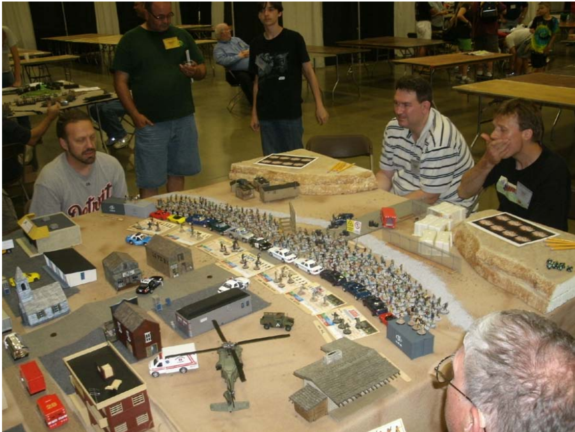
The Gray Mass At The Right Are Zombies, Faced By BLACKWATER INC (the real horrors) And the A-Team Among Others, Personally I Think Vampires Have More Class