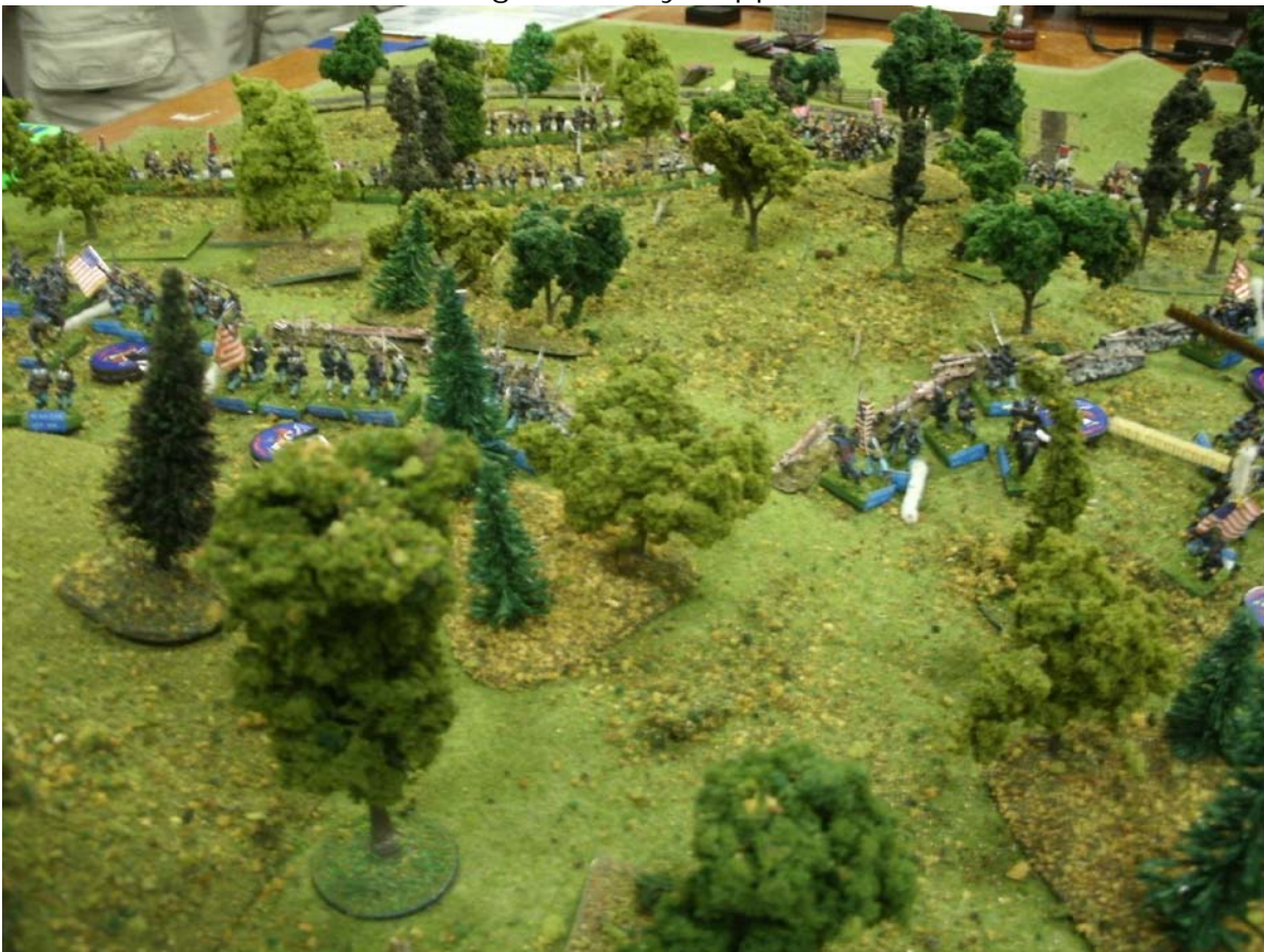
The War Of Northern Aggression Draws Its Fair Share And More