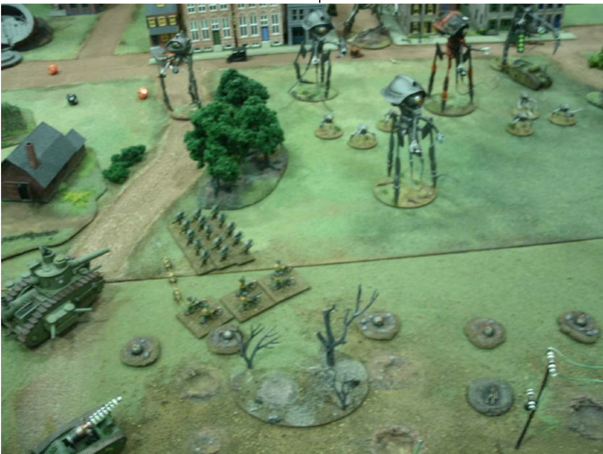
More Dark Side-Like H.G. Wells War of Worlds But We Are Taking It To them