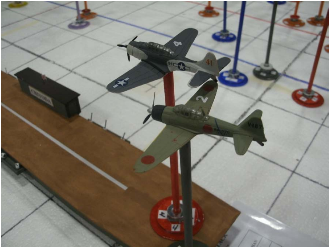
The Occasional Airplanes