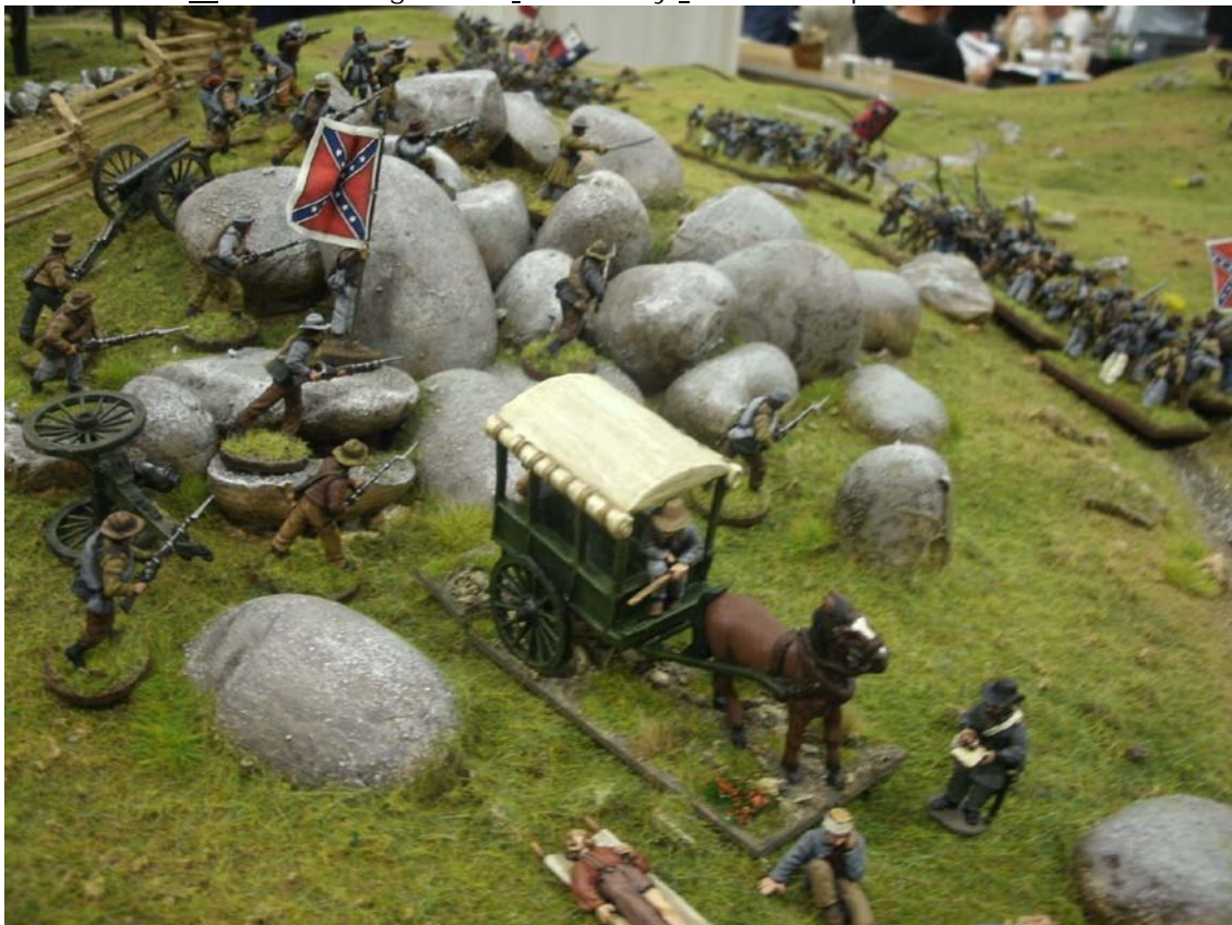
But Other Masses In Gray Were Better Represented Over The Weekend