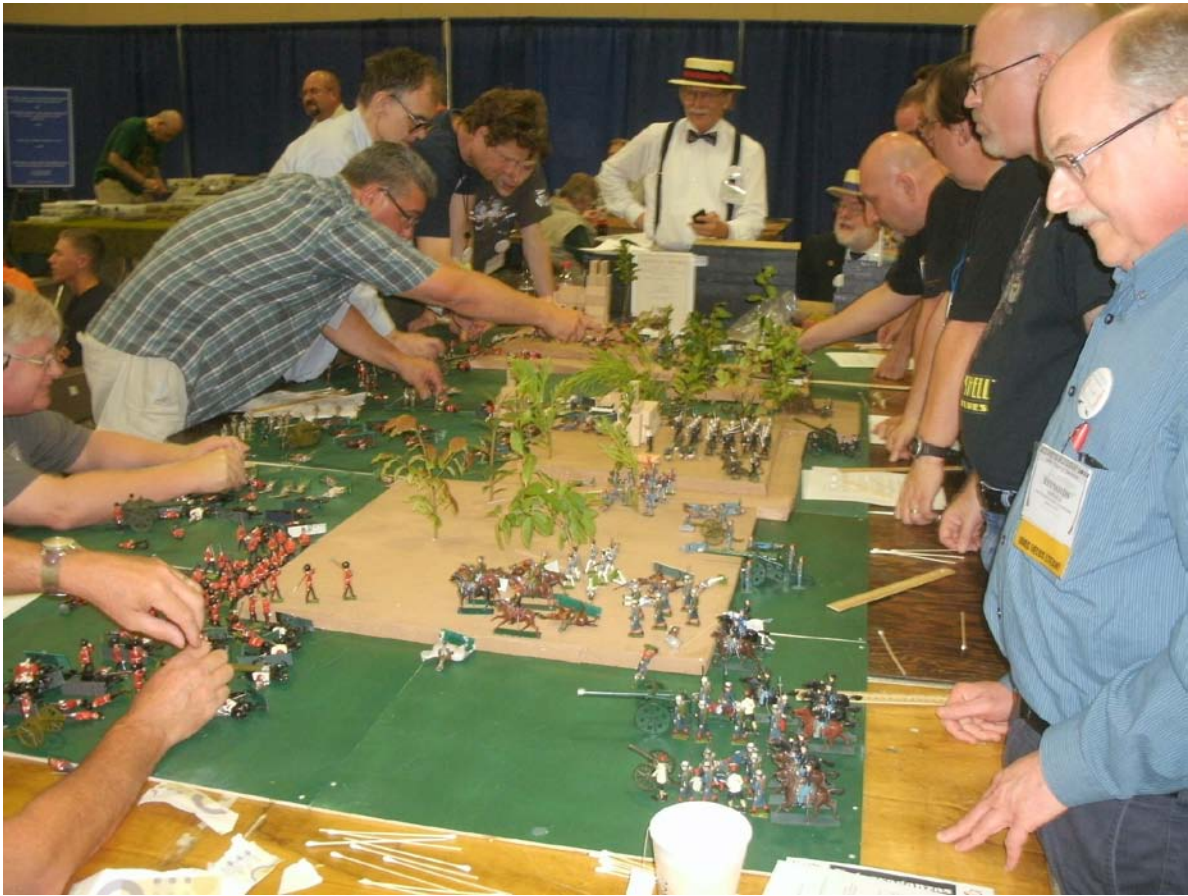
So He Brought Back Little Wars With The Help Of Someone Dressed as JKJ