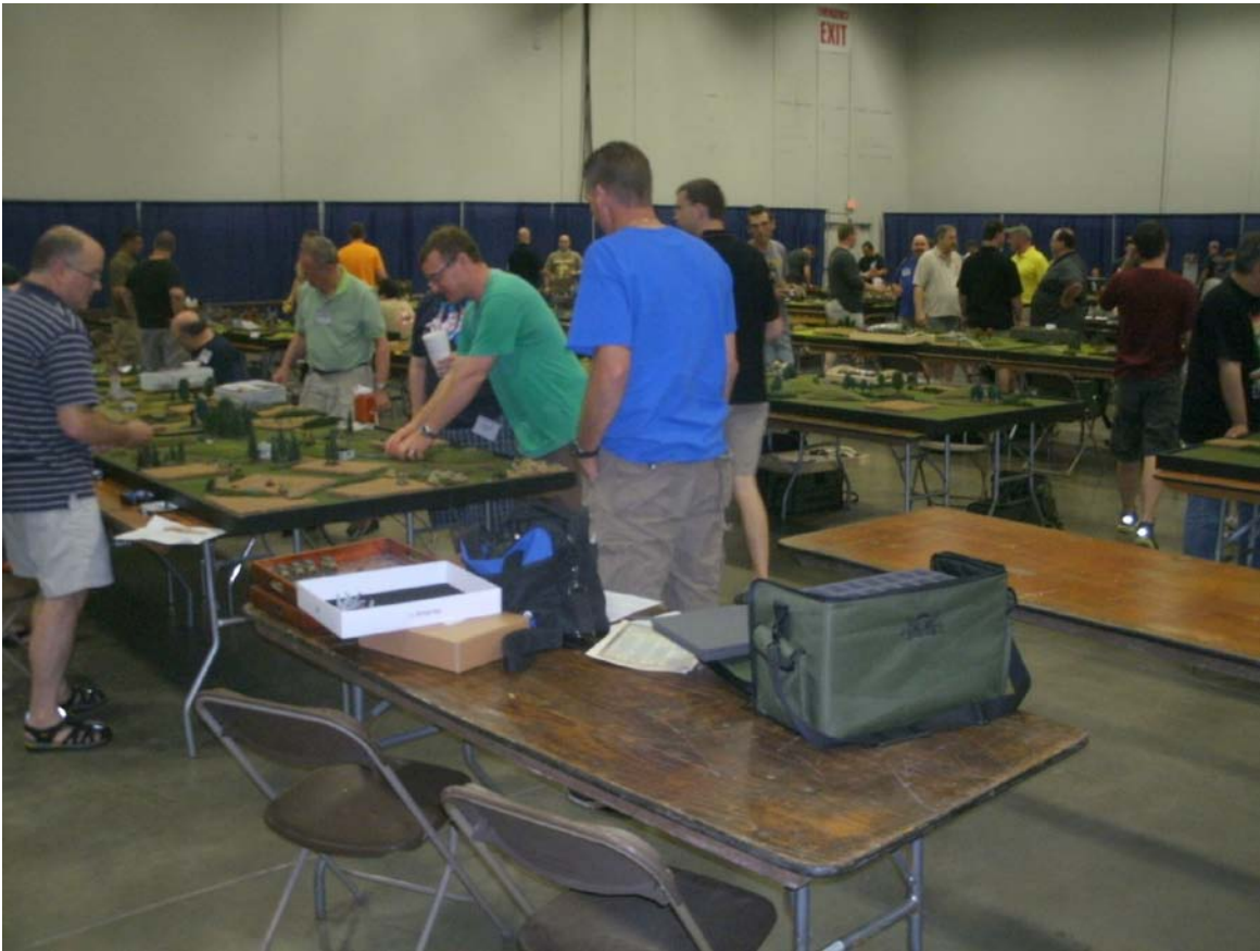
Both Open And National FOW Events Were Well Attended