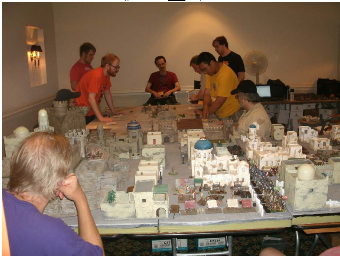
The Wednesday Night Gamers of Alexandria Brought Back The Middle East