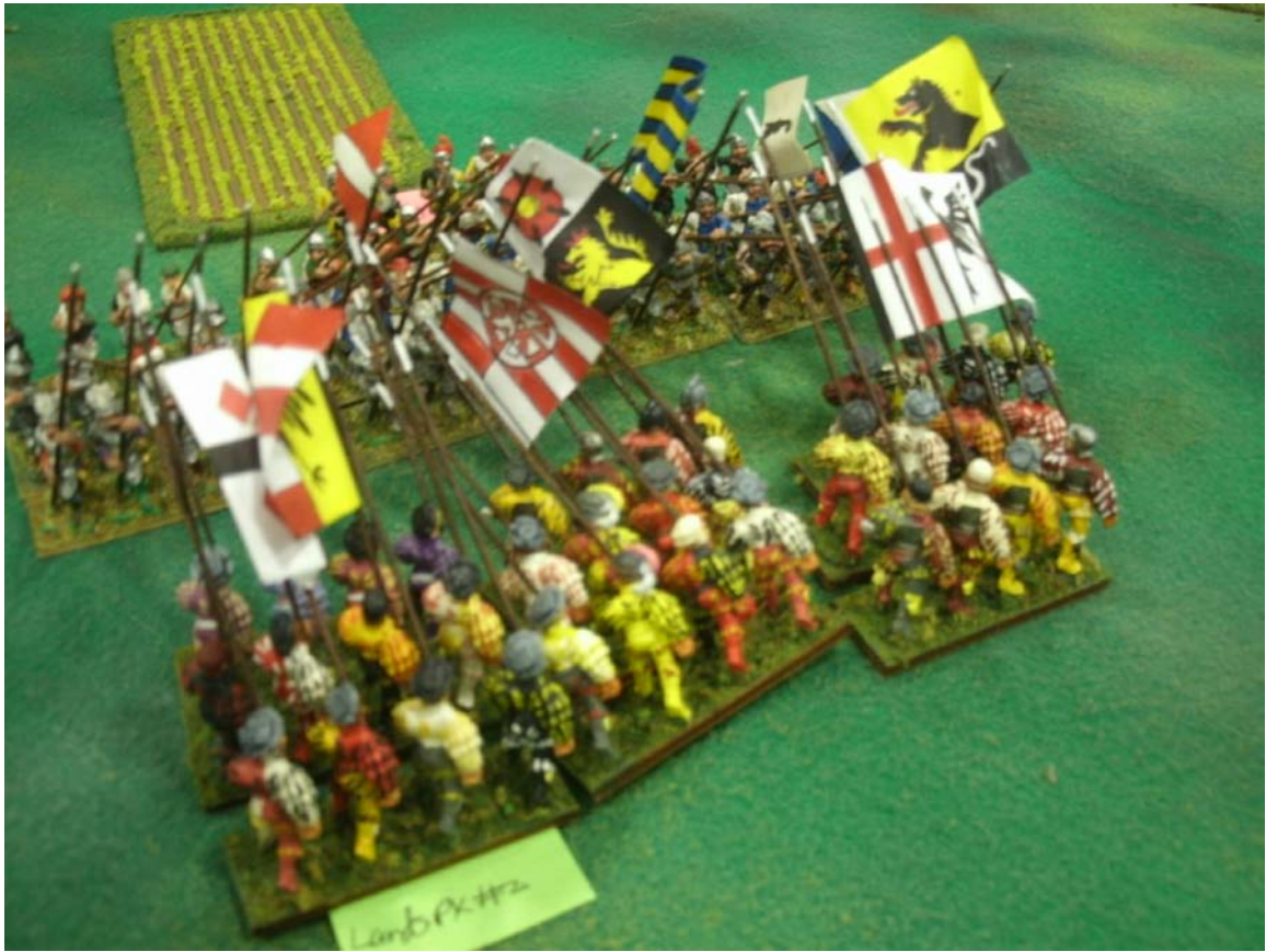
The Occasional Pike And Shot