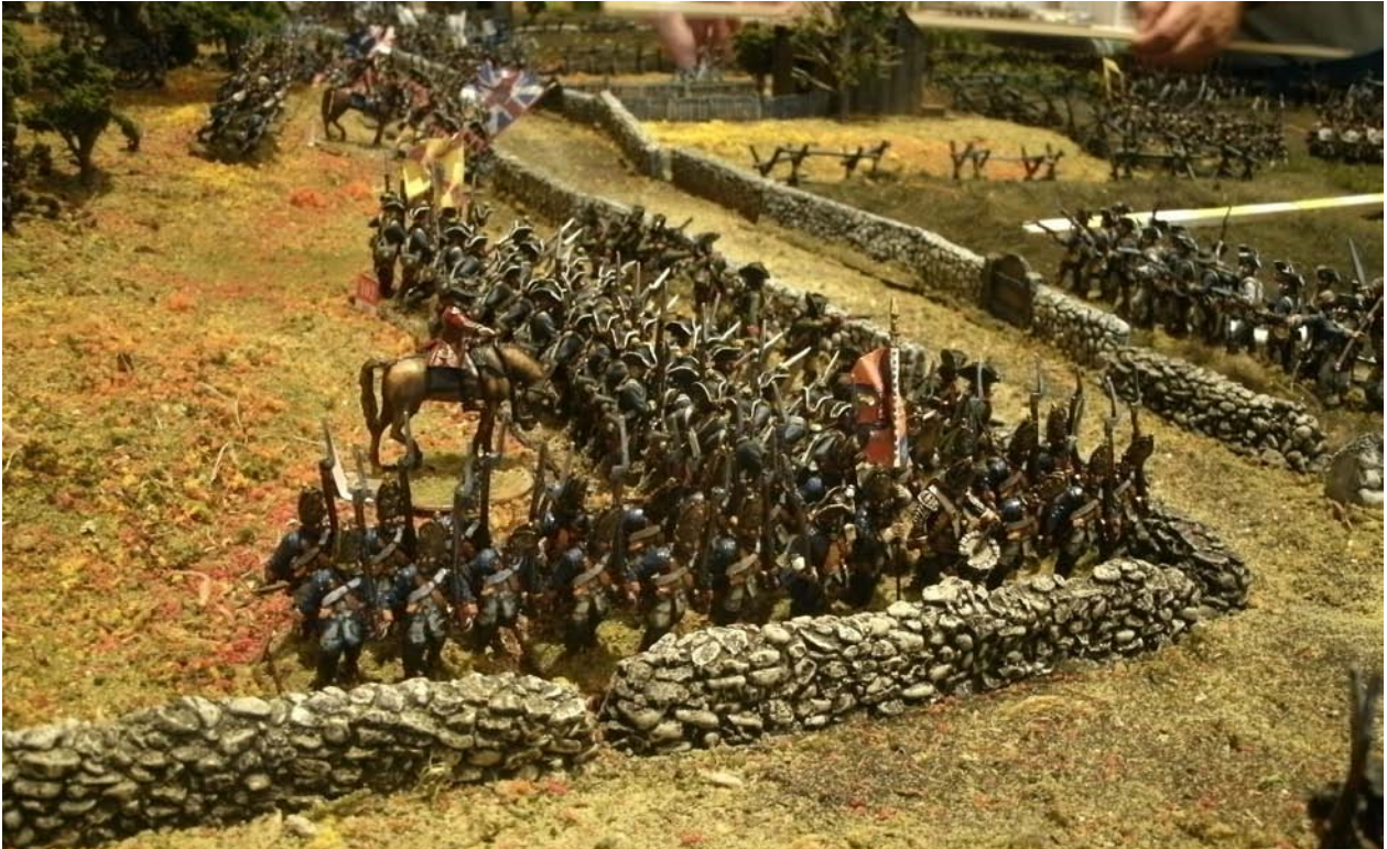
I Don't Recognize This, But The Figures And Terrain Were Great!