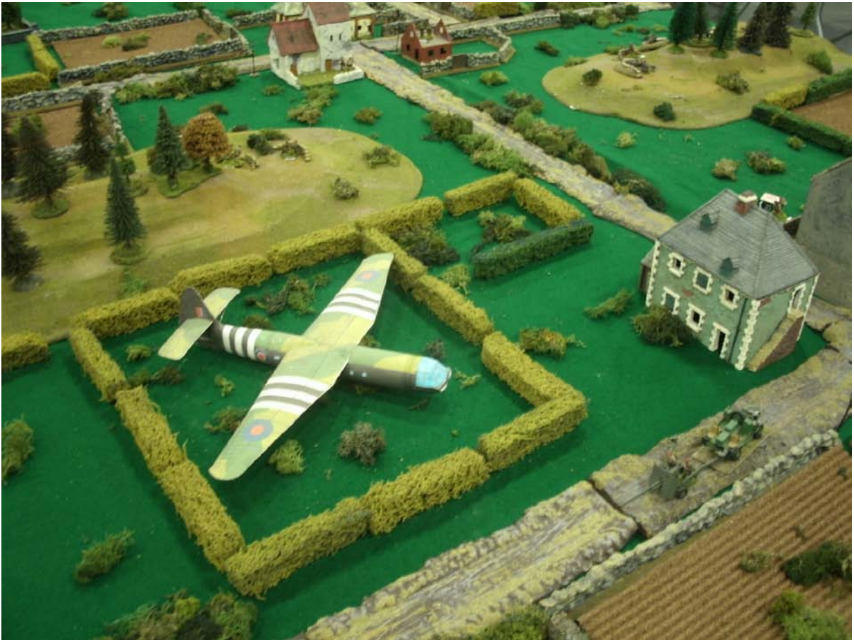
Horsa Bridge Takes The Brits Towards Their Bridge Too Far