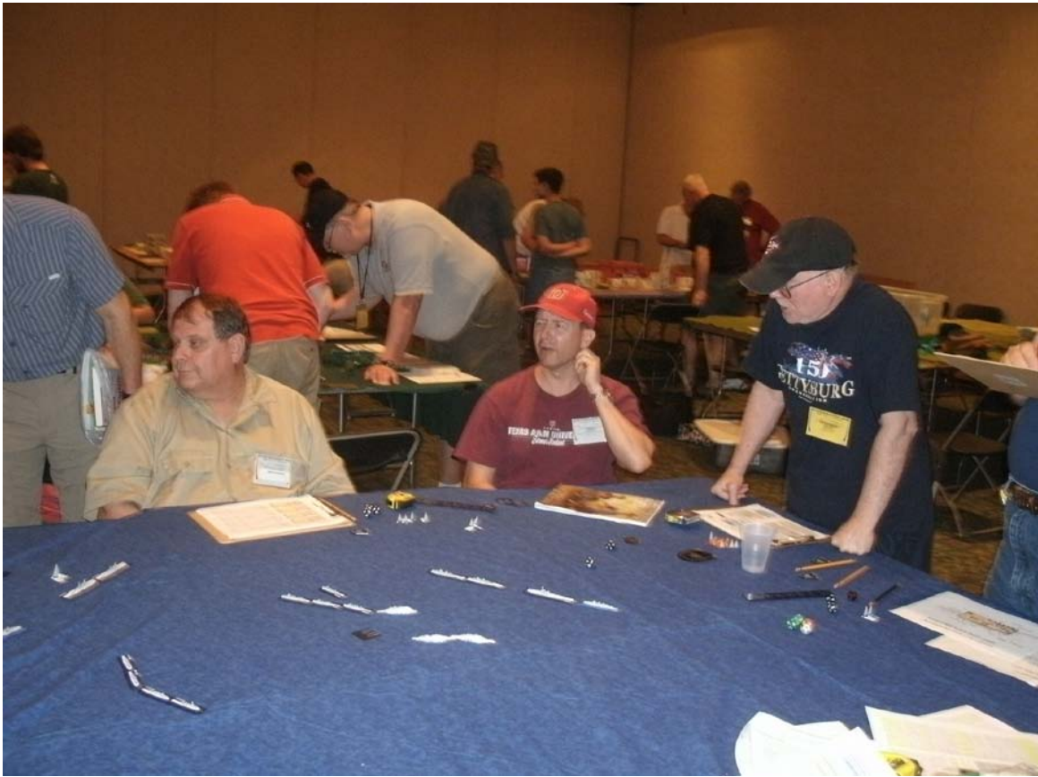
Of Course There Were The Complicated Naval Games Favored By My Son