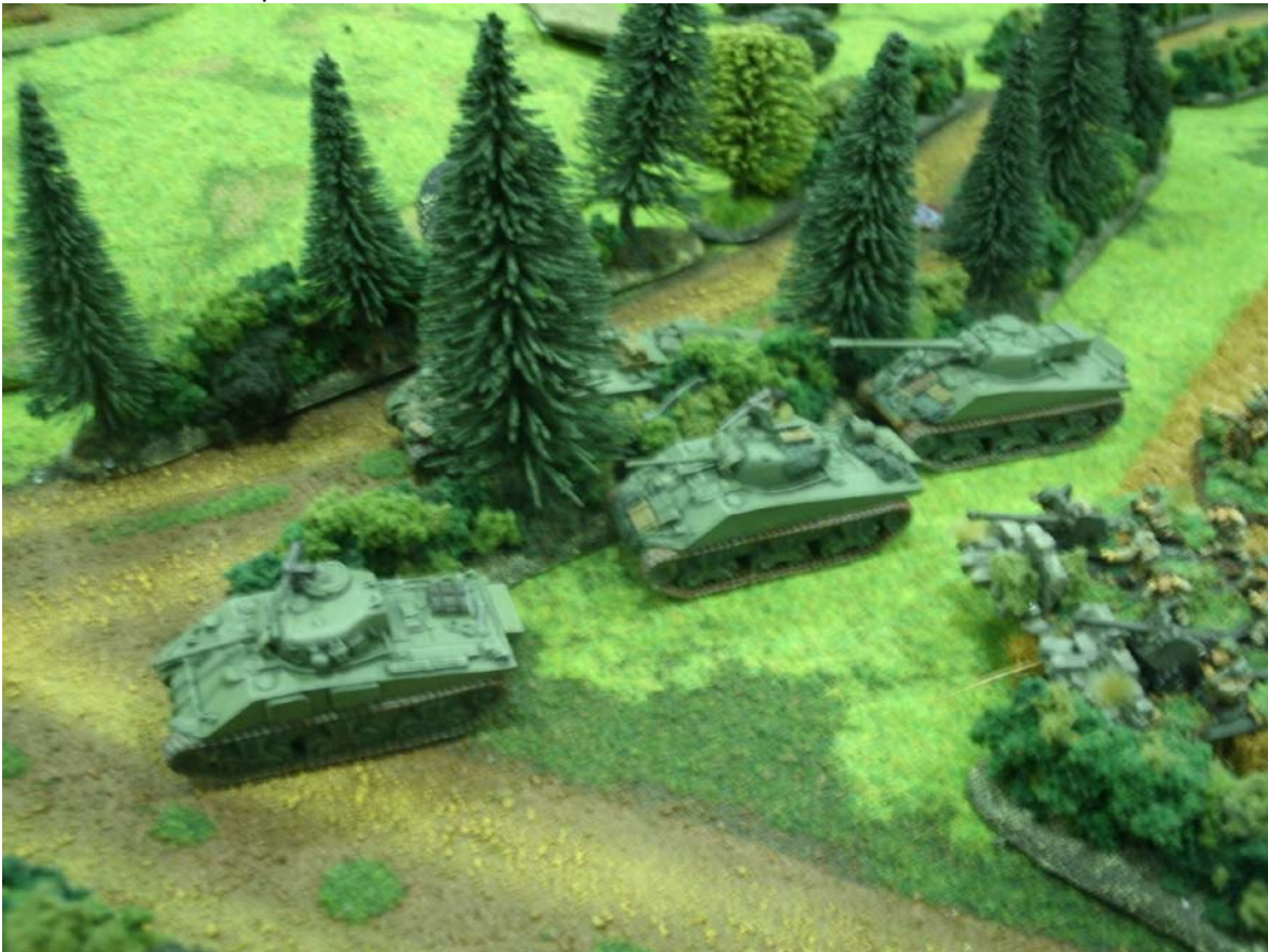
Game In Progress