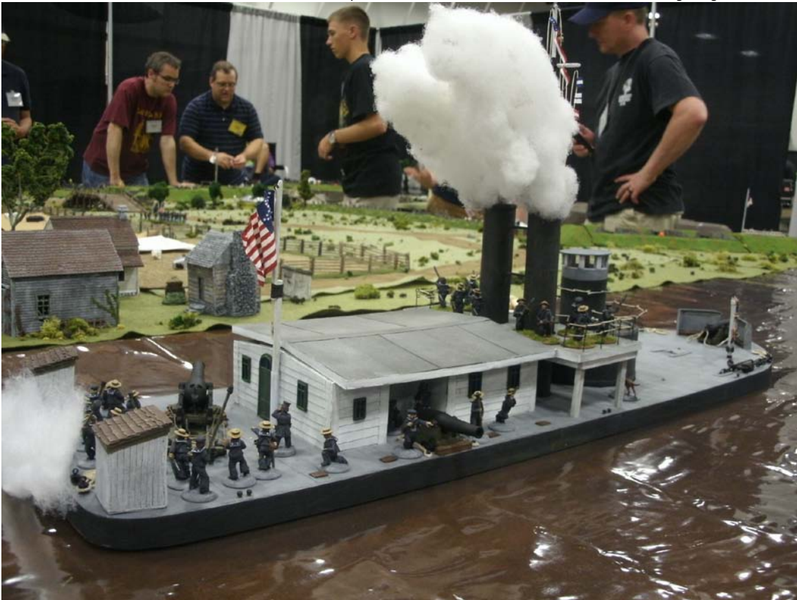
And Some Rather Larger Vessels