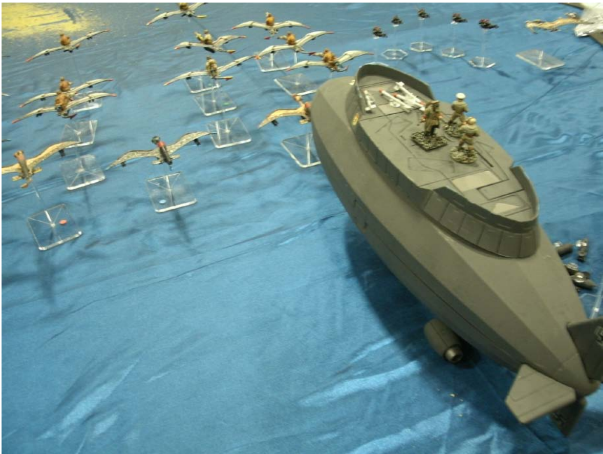
Pterosaurs Attack-Said To Be Pulp But Looks Like Sci-Fi To Me