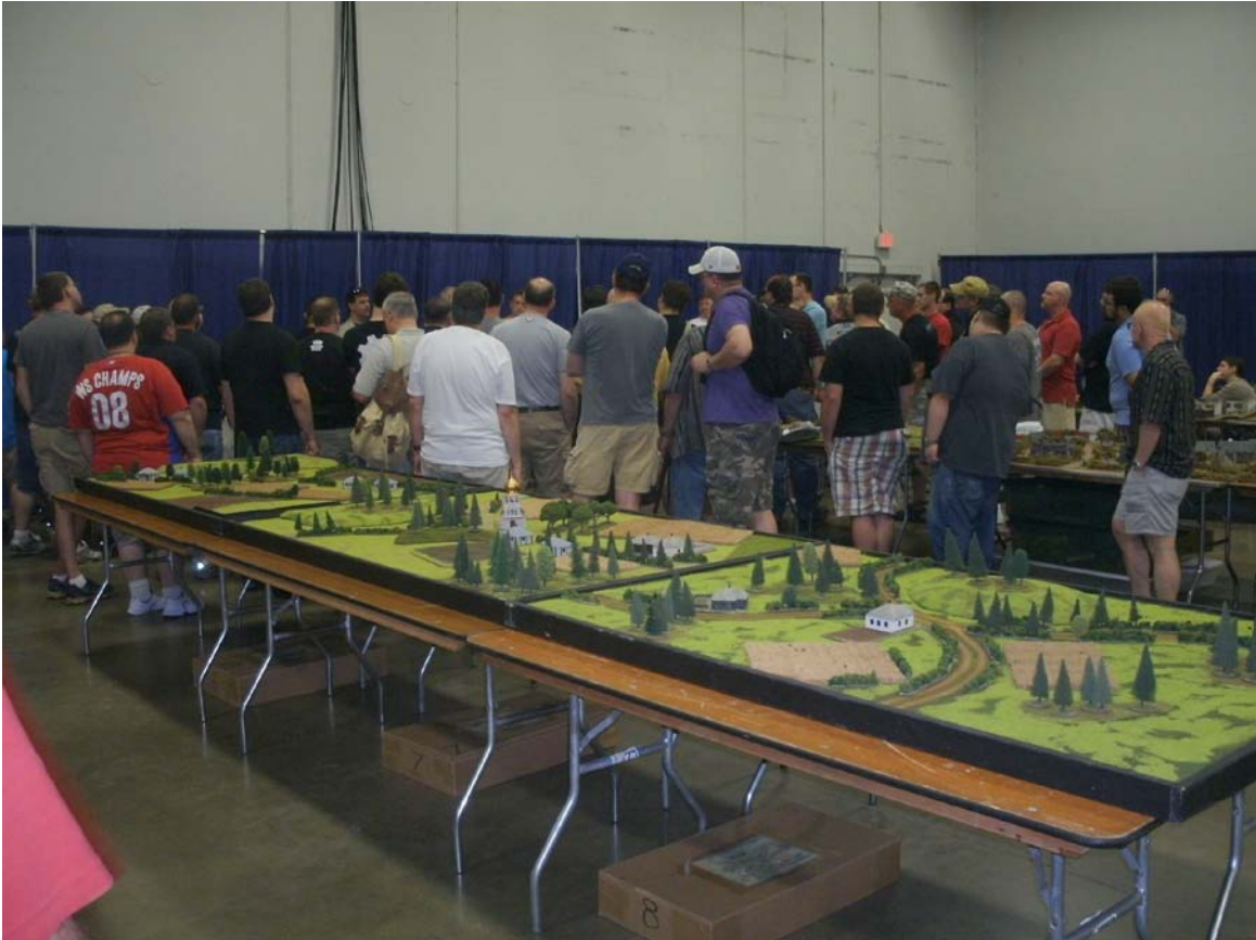
Meanwhile the Battlefront Corporation Rallied The FOW Clans