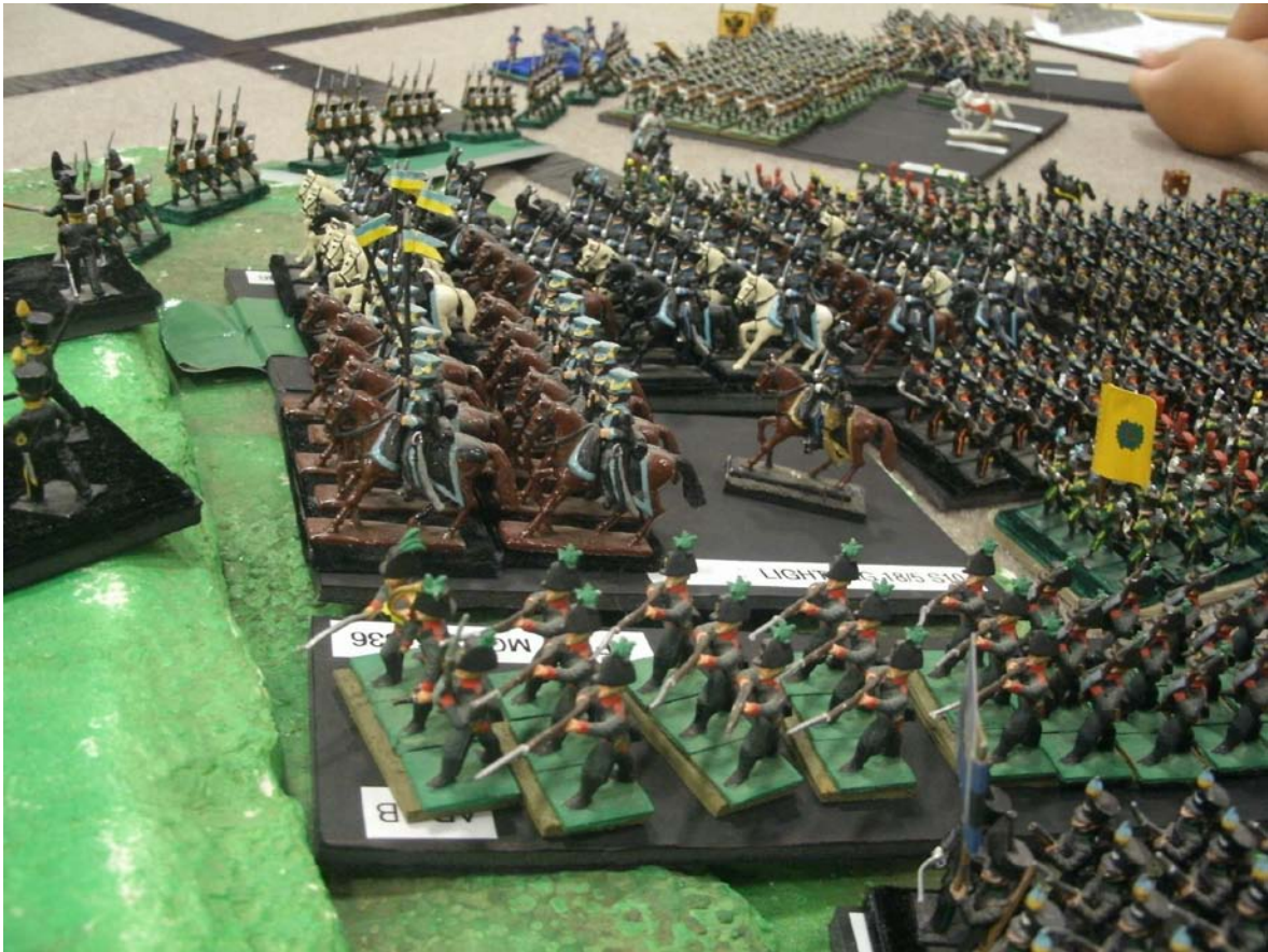
More Remarkably, An Unscheduled Mass 25mm Showed Up Sunday

While most gamers cleared out on Sunday there was still some activity and even more in the dealer area. And while there were as usual many games, the proportion from the dark side was not abnormal. However there seemed to be more dark side vendors than usual. To my left was a booth selling collectible card games (Historical Conquest), and around the corner from them there was a really slick computer game company (Matrix Games.)