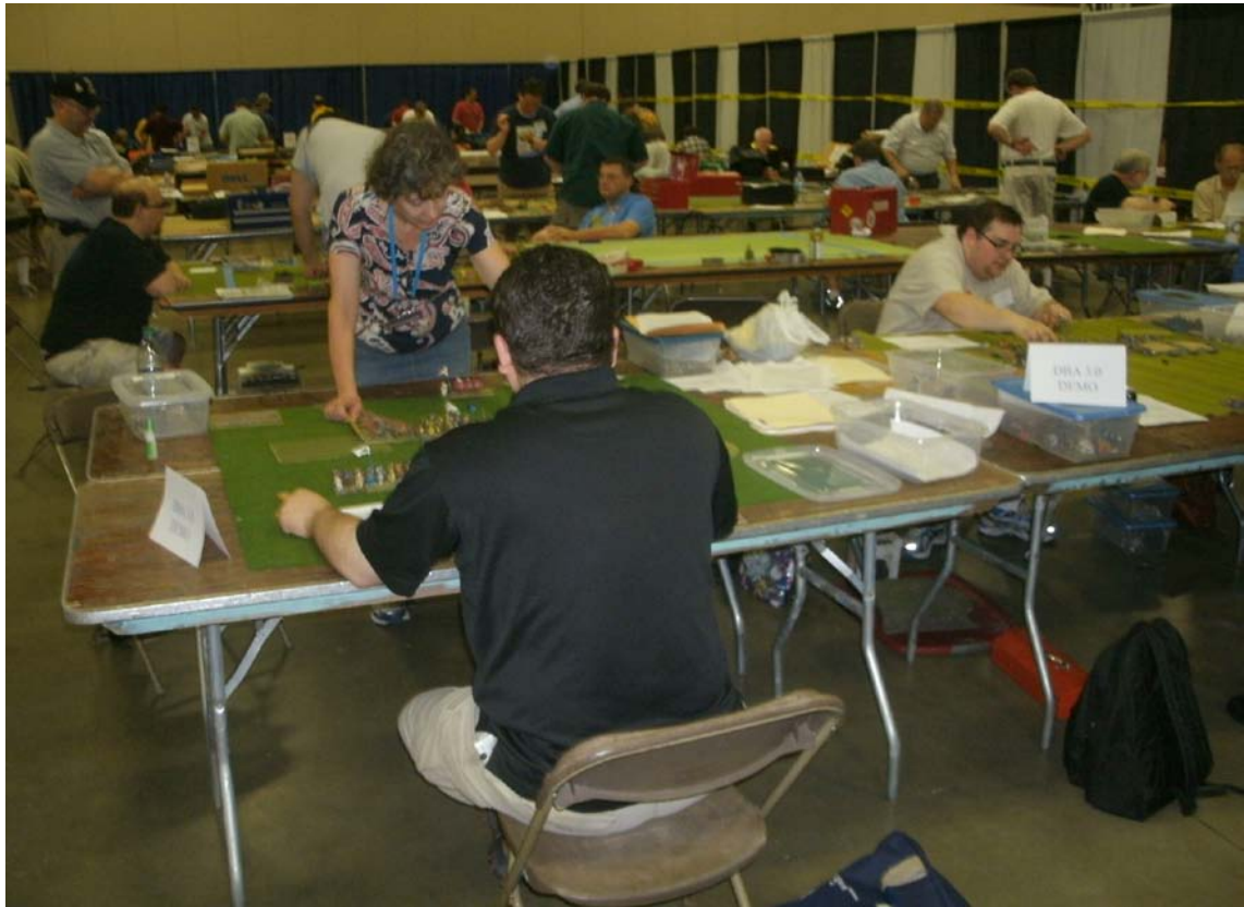
Across The Way WRG And Other Ancients Tournaments Were Ongoing